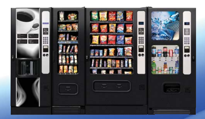
Full Line Vending Products & Services

Dispense a wide variety of foods & beverages.