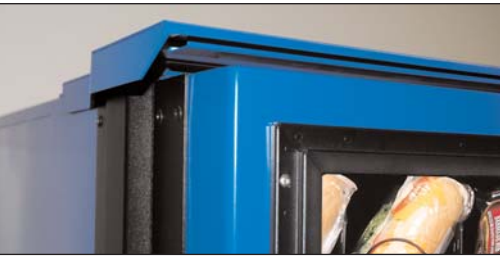
High Security Package

Impact resistant Lexan window cover, rain guards and anti-pry covers provide superior resistance to the elements vandals and thieves