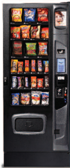
Shown with optional ADA door, iCart touch screen & kick panel.