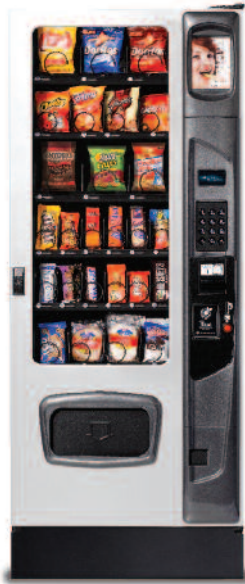
Shown with optional ADA door, custom door color & kick panel.