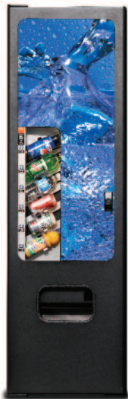
Summit 300 Satellite