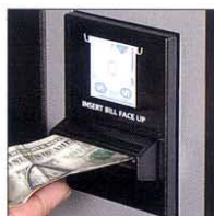
MDB Payment System Ready Including coin, bill, and card reader acceptance.