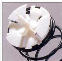
Adjustable Helixes 360 - degree helixes adjust in 20 - degree increments giving you the ability to vend just about anything.