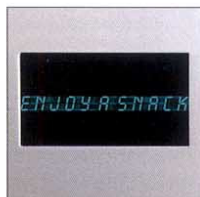
Scrolling Message Display With Multi-Language Programming