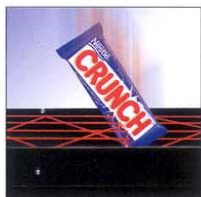
iVend® Delivery Sensing Technology Ensures money back vending performance.