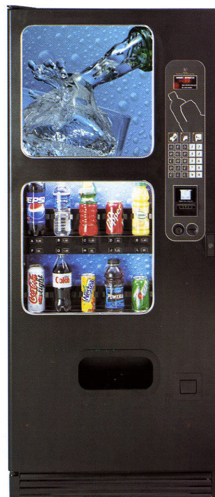
CB500 – Cold Drink Vendor 10 Selections with 500 12 oz. can and 240 20oz. bottle capacity.