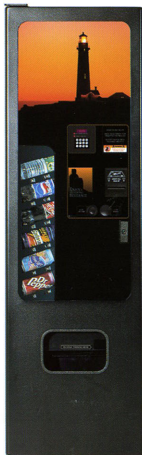
CB300 Stand Alone Drink Vendor