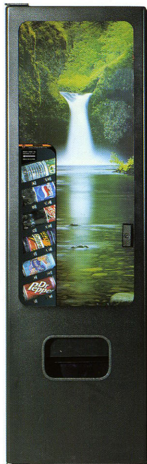
CB300 Satellite Drink Vendor

From five employee locations to five hundred employee locations, USI has the drink vendor that is right for you. Vend 12 ounce cans, 20 and 24 ounce bottles and most of the styled beverage containers on the market all out of one machine. Our vendors give you the versatility to provide your customers and employees with the beverages they desire most.