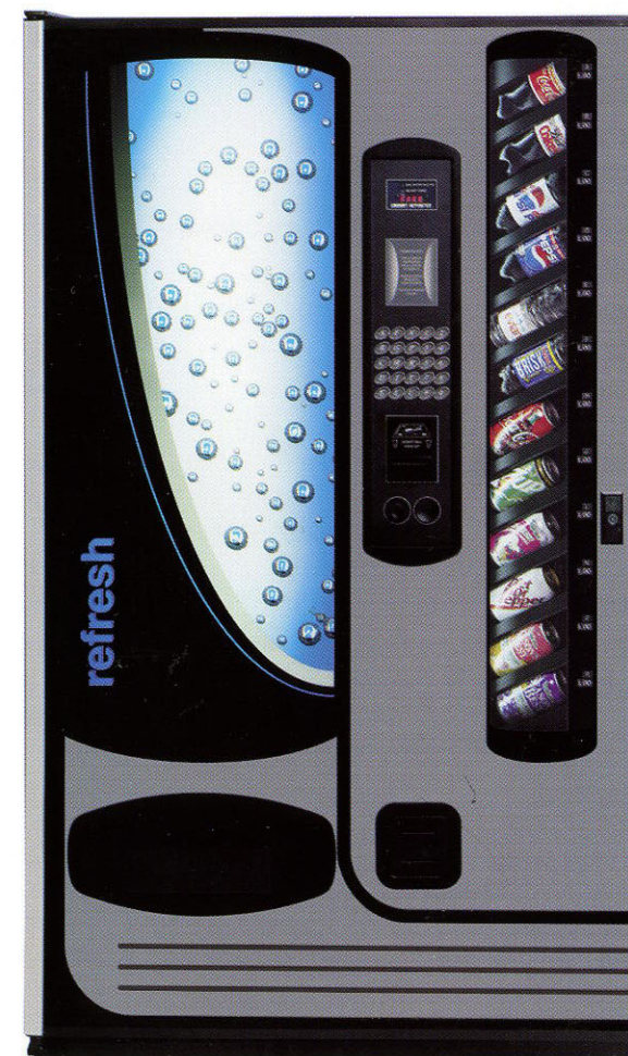
CB700 – Cold Drink Vendor Highest capacity for the largest locations.