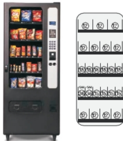
M3000 23 Selections 60 Snack / 168 Candy 72 Gum & Mint / 48 Pastry