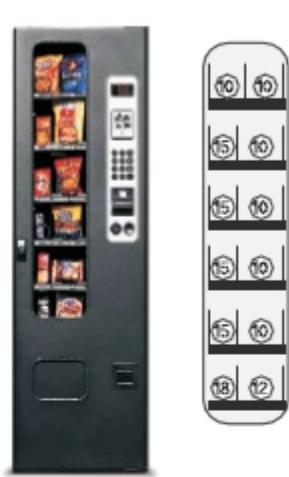
M2000 12 Selections 74 Snack / 78 Candy