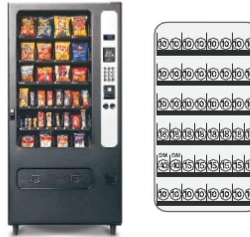
M4000 32 Selections 120 Snack / 234 Candy 80 Gum & Mint / 40 Pastry