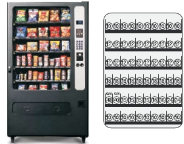
M5000 40 Selections 170 Snack / 324 Candy 80 Gum & Mint / 50 Pastry

USI's new Global Vending Controller (GVC) incorporates all the proven sales and service features you've come to expect from USI merchandising systems, including: