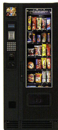
SC100/FF 2000 Frozen Food Vendor