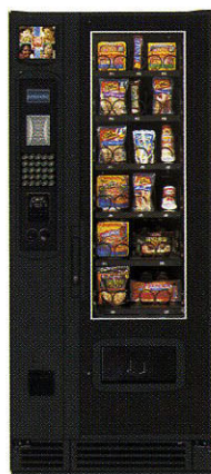
SC100/CF 1000 Cold Food Vendor

Locking door on SC100 for separation of satellite product loading and currency retrieval.