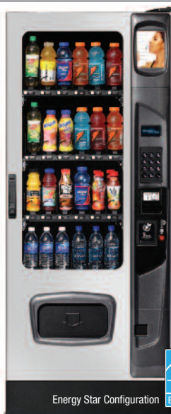
Shown with optional silver ADA door in full beverage configuration, and optional kick panel.