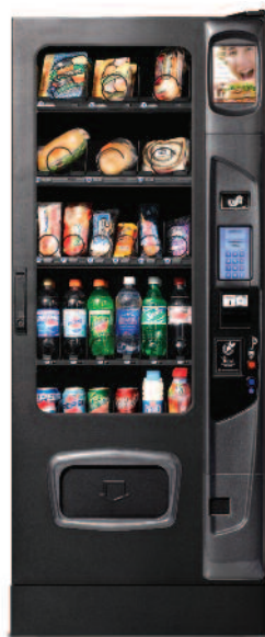
Shown in black with optional ADA door, iCart touch screen and kick panel.