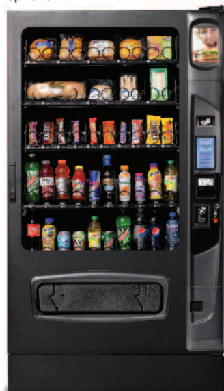
Shown in black with ADA door, iCart touch screen and kick panel options.