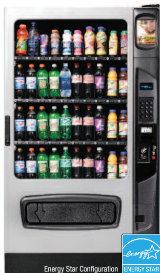
Shown in full beverage configuration with silver ADA door and kick panel options.