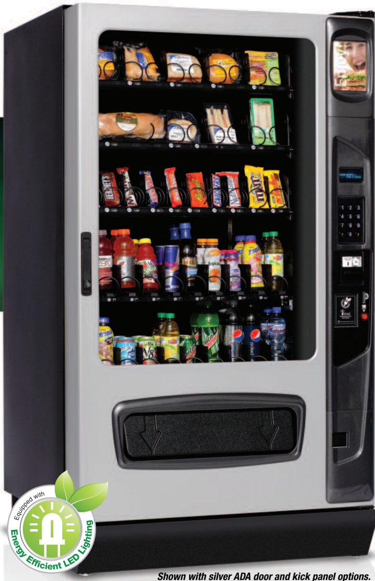
Shown with silver ADA door and kick panel options.

The Alpine ST5000 glass front refrigerated food & beverage merchandiser provides the largest dispensing capability with class leading energy efficiency. Vend sodas, juices, milk, yogurts, and other foods best served cold from one versatile package.