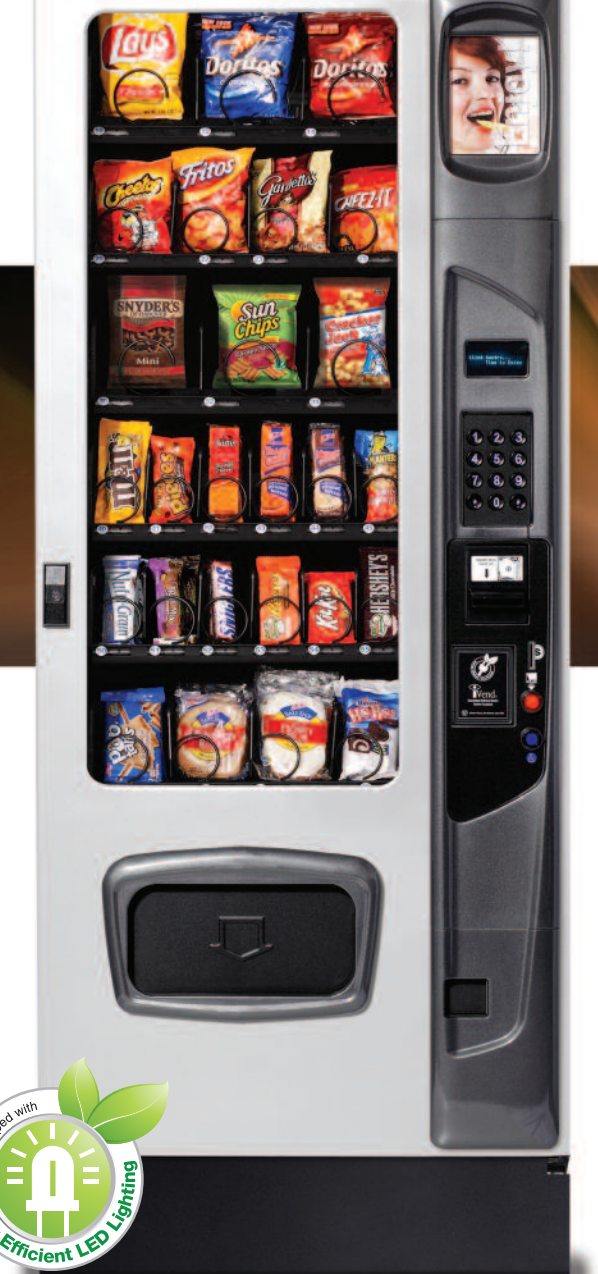
Shown in optional silver & black with Advanced Ergonomic Styling and optional kick panel.