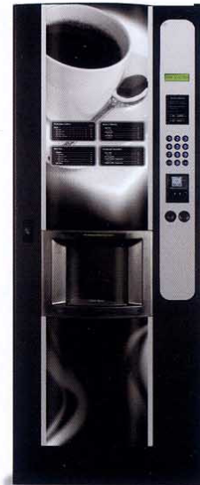
Shown with monochrome styling.

*Available with or without cream and sugar. †Available with or without sugar.